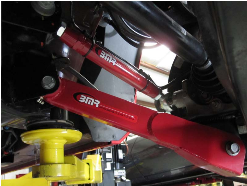
BMR Adjustable Toe Rod and Trailing Arm